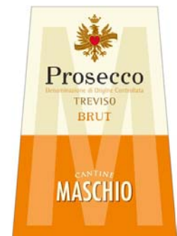
100% Prosecco (Veneto)