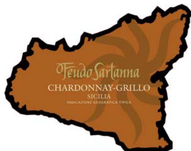
70% Chardonnay, 30% Grillo (Sicily)