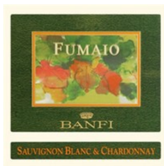
Sauvignon Blanc and Chardonnay (Tuscany)