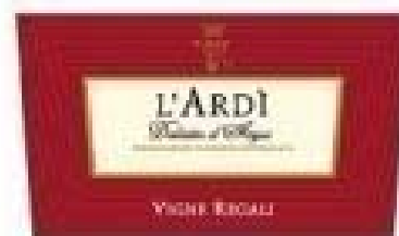
100% Dolcetto grapes (Piedmont)

Special Bar Menu Available ~ Come Join Us!